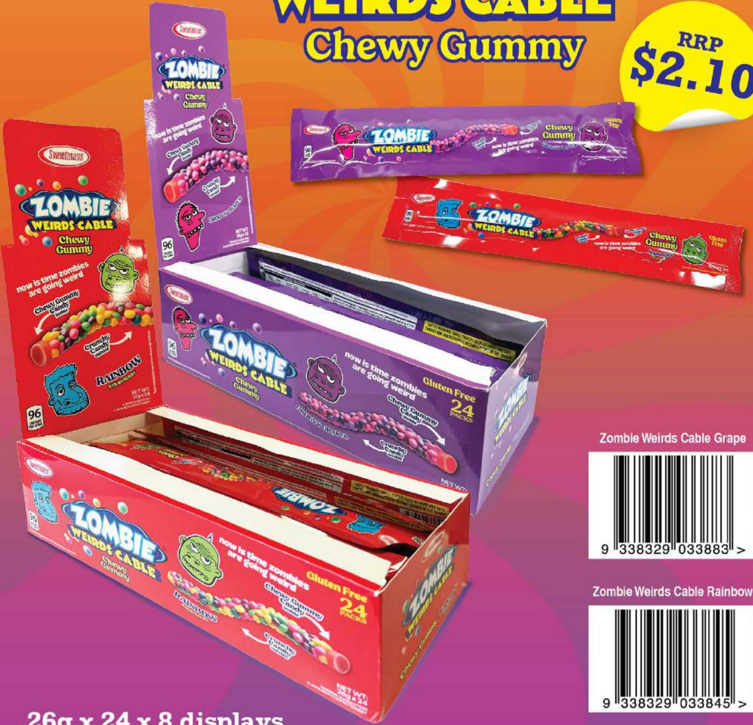
Zombie Weirds Cable Grape